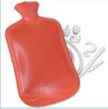
Figure 1. A standard rubber enema/douche bag