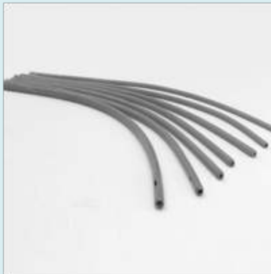
Figure 2. An assortment of rubber colon tubes

Most people do not use colon tubes, which are more difficult to insert. I do not believe using a colon tube is necessary in most cases, though it will move the coffee mixture around the colon better.