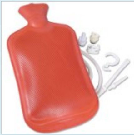
Figure 1. A standard rubber enema/douche bag