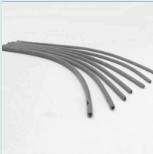
Figure 2. An assortment of rubber colon tubes

Most people do not use colon tubes, which are more difficult to insert. I do not believe using a colon tube is necessary in most cases, though it will move the coffee mixture around the colon better.